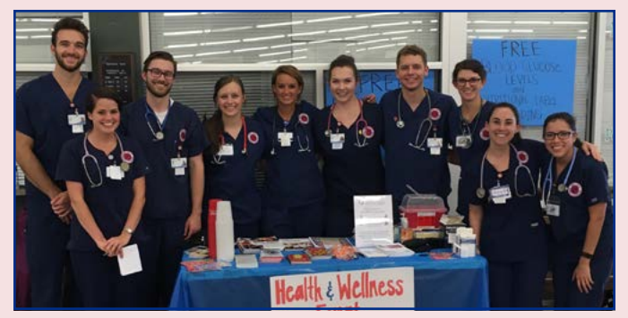
Oxford Accelerated BSN students offered free health screenings for the community at Larson's Cash Savers.

Accelerated BSN students on the Oxford campus participated in student-driven, community health advocate (CHA) events during the summer semester. Health fairs took place at Larson's Cash Savers, Panera Bread Company and the Oxford City Farmers Market. The fairs provided culturally appropriate health information, assisted individuals in identification and linkage to resources in the Oxford community, provided basic health screenings (blood pressure, blood glucose, BMI, etc.) and increased health literacy in the community.